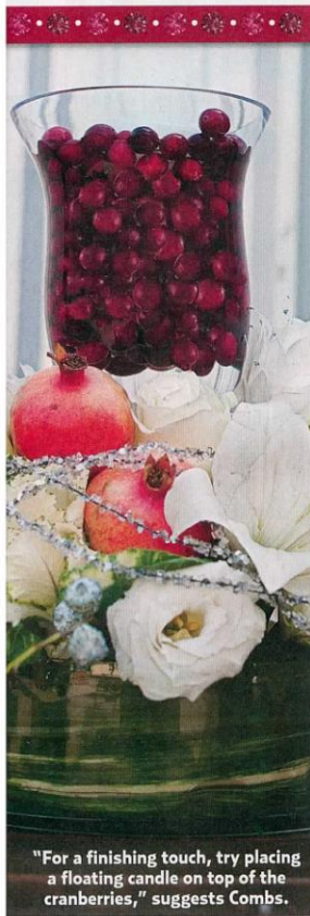
"For a finishing touch, try placing a floating candle on top of the cranberries," suggests Combs.